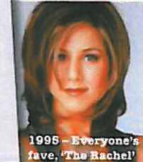
1996 - Everyone's fave, 'The Rachel'

Tip! Next time you detox, give your hair some thought too. Wash with a clarifying shampoo to get rid of product build-up and massage your scalp for a proper clean