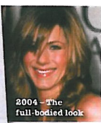
2004 - The full-bodied look