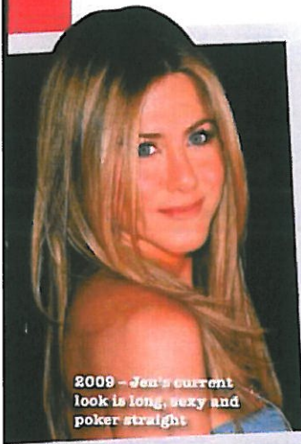
2009 - Jen's current look is long, sexy and poker straight